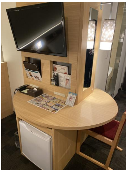
Desk, TV, refrigerator